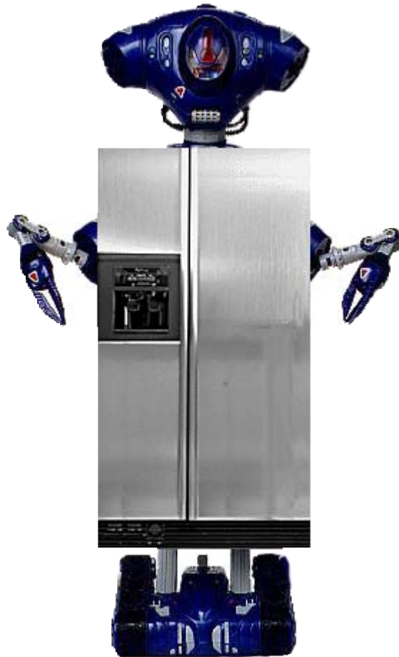
Roving Refrigerator – Stationary Position