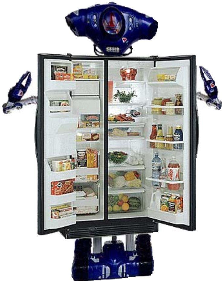
Roving Refrigerator – Delivery Position