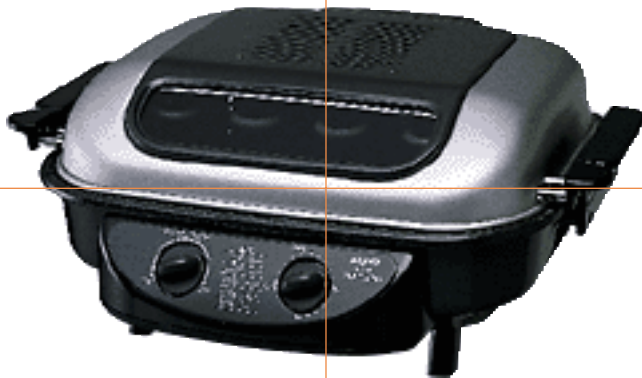
Your Guess is as Good as Mine