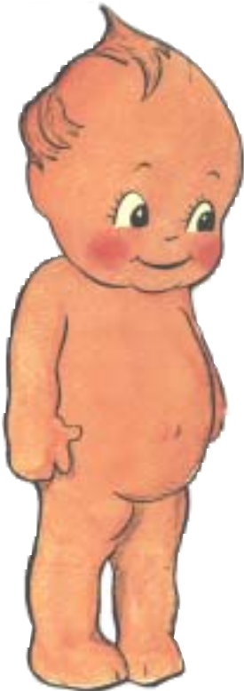
The TotBot® 2000

contemplation place origin anonymous collapse stitch flexibility autonomy horizontal embed emerge evolve process interaction conversation articulate wants needs suspicious domain colic comfort confident cradle crib crying peek-a-boo diaper rash laundry hard-core hyperlogical clean concise interpersonal larger context opaque transparent voices locate domestic domesticate paradox desire instruments communication collaboration device extensions power physical universe strict permissive disobedient dreams nightmares drool earache teething bedwetting friendly inviting foreplay intercourse sedation chemically induced medically supervised bond primitive philosophy rigid flexible equipment coitus formidable fever finger food first aid allergic reaction cuddle fracture fluoride fluids erect hot spontaneous processing damaged uterus womb rational clutter dysfunctional monitors uncomfortable faint hum apply white noise tissues ambulatory insemination observing the procedure sterilize sterile information recovery rejection normal fetal symbiotic caregiver rivalry growth hormone puberty hemorrhage hormonal hunger medicate pervasive subjected increased aspect