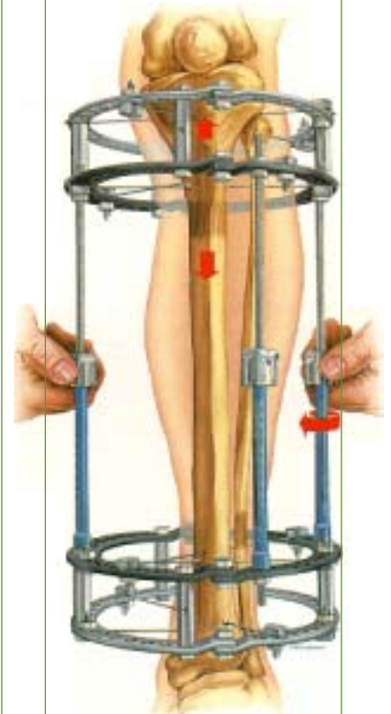
Limb Harvesting for Transplant