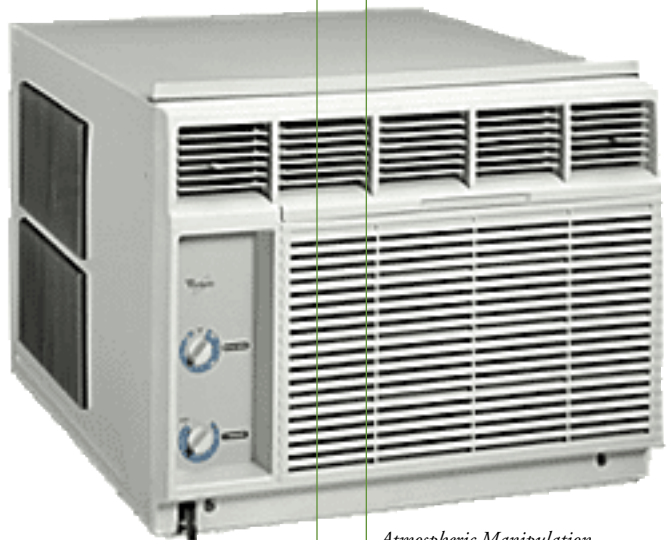
Atmospheric Manipulation and Destruction Unit