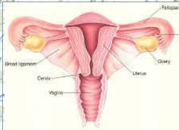
More of the Same